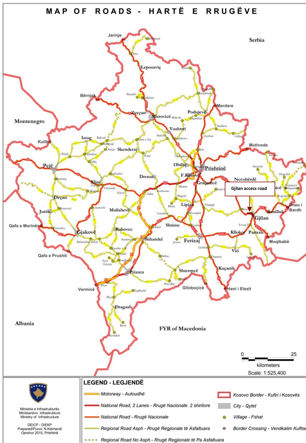
Figure 1: Map of Roads of Republic of Kosovo

The length of the access road will be 2,900 m and will include four roundabouts and the following infrastructure: electricity, sewer system, runoff drainage system, traffic signs and lighting.